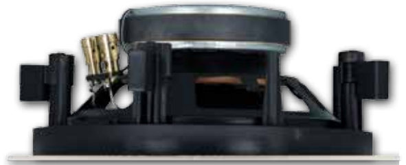
Side-View of Frameless Grille