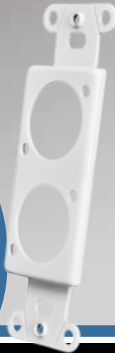
2 Spaces for D Series Accessories / Devices. Decorator Style Premium Steel Plate.