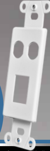
2 Spaces for 5-way Binding Post, RCA, Coaxial, Mini, or BNC & 1 Space for RJ-11 or RJ-45 Modular Connectors.