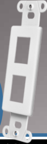
2 Spaces for RJ-11 or RJ-45 Modular Connectors. Decorator Style Premium Steel Plate.