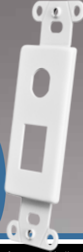
1 Space for 5-way Binding Post, RCA, Coaxial, Mini, or BNC & 1 Space for RJ-11 or RJ-45 Modular Connectors.