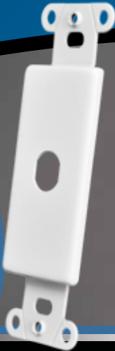
1 Space for a 5-way Binding Post, RCA, Coaxial, Mini, or BNC Modular Connector. Decorator Style Plate.