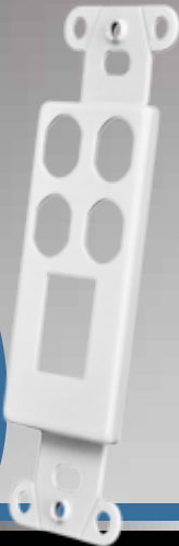
4 Spaces for 5-way Binding Post, RCA, Coaxial, Mini, or BNC & 1 Space for RJ-11 or RJ-45 Modular Connectors.