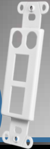
2 Spaces for 5-way Binding Post, RCA, Coaxial, Mini, or BNC & 2 Spaces for RJ-11 or RJ-45 Modular Connectors.