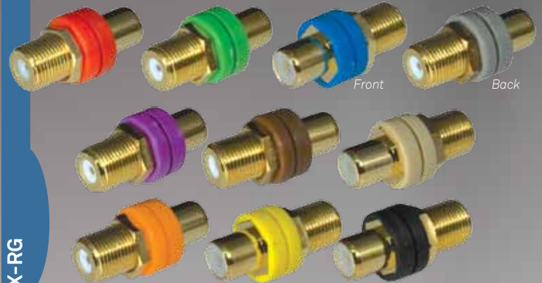
Gold-Plated Connectors with Coaxial Front and RCA Back.