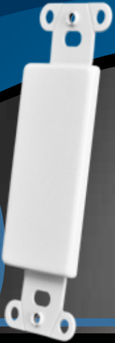
Blank Plate, Decorator Style Premium Steel Plate.