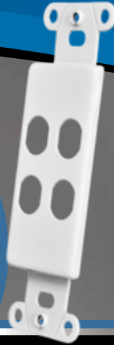
4 Spaces for 5-way Binding Post, RCA, Coaxial, Mini, or BNC Modular Connectors. Decorator Style Plate.