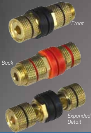
Gold-Plated Connectors with 5-Way Binding Post Front and Back. Accept Banana Plugs, Dual Banana Plugs, Spade Lugs, Pins, or Bare Wires.