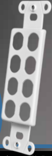
8 Spaces for 5-way Binding Post, RCA, Coaxial, Mini, or BNC Modular Connectors. Decorator Style Plate.