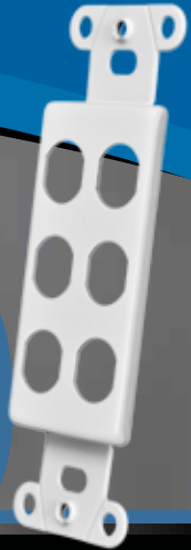
6 Spaces for 5-way Binding Post, RCA, Coaxial, Mini, or BNC Modular Connectors. Decorator Style Plate.