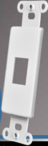
1 Space for RJ-11 or RJ-45 Modular Connector. Decorator Style Premium Steel Plate.