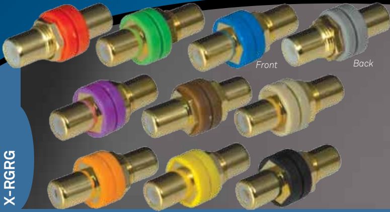
Gold-Plated Connectors with RCA Front and RCA Back.