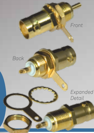
Gold-Plated Connectors with BNC Front with Solder Back.