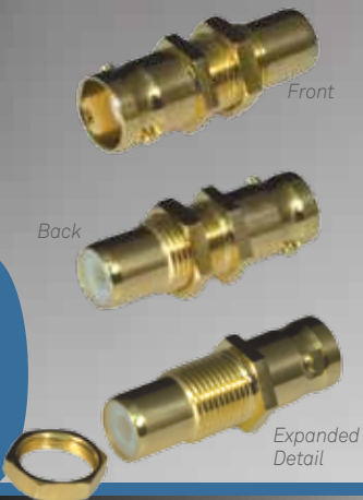
Gold-Plated Connectors with BNC Front with RCA Back.