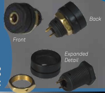
Gold-Plated Connectors with Mini Headphone (1/8") Front and Solder Back.