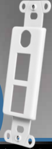
1 Space for 5-way Binding Post, RCA, Coaxial, Mini, or BNC & 2 Spaces for RJ-11 or RJ-45 Modular Connectors.