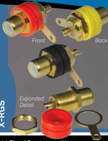
Gold-Plated Connectors with RCA Front and Solder Back.