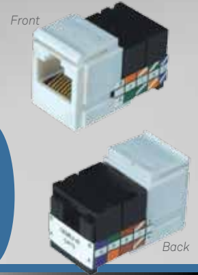
Snap in RJ-45 Punch Down Style. PA-9 Colored Decals included for Port Assignment.