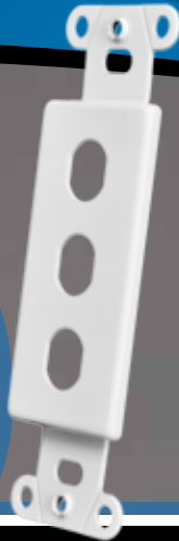
3 Spaces for 5-way Binding Post, RCA, Coaxial, Mini, or BNC Modular Connectors. Decorator Style Plate.