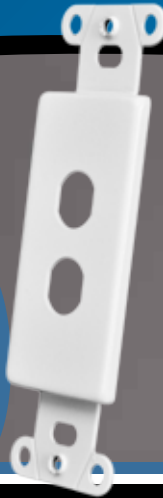
2 Spaces for 5-way Binding Post, RCA, Coaxial, Mini, or BNC Modular Connectors. Decorator Style Plate.