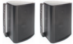
(2) Cabinet Speakers (2) Attached "U" brackets