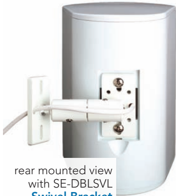
rear mounted view with SE-DBLSVL Swivel Bracket (not included)