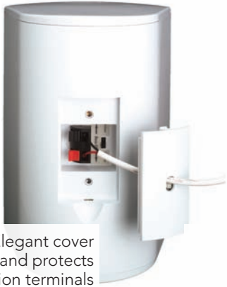
Elegant cover conceals and protects connection terminals