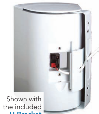
Shown with the included U-Bracket