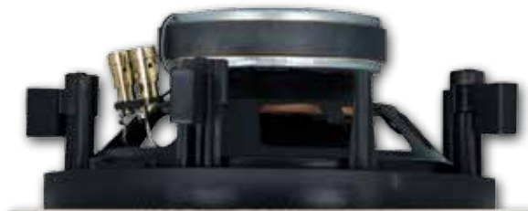
Side-View of Frameless Grille