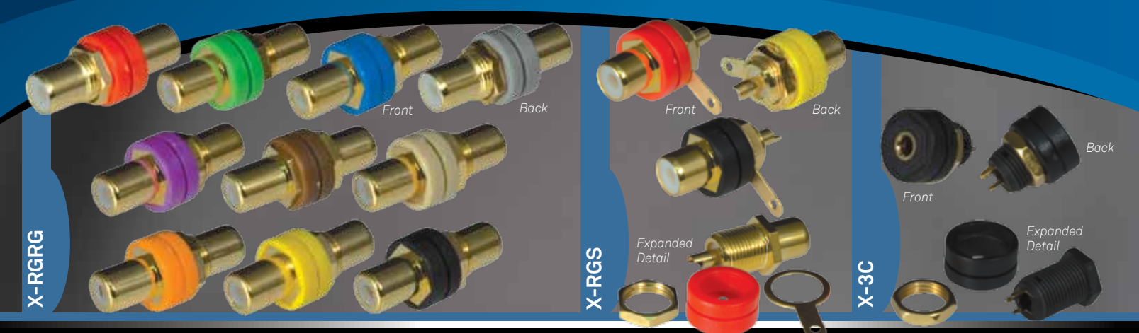
Gold-Plated Connectors with RCA Front and RCA Back.