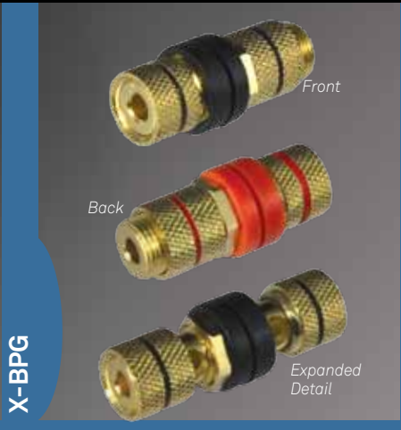
Front Back Expanded Detail